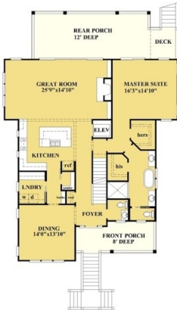
FIRST FLOOR PLAN 1731 HEATED SQUARE FEET